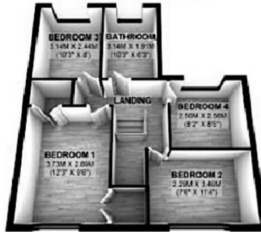
FIRST FLOOR APPROX. 51.5 SQ. METRES (548.9 SQ. FEET)

TOTAL AREA: APPROX. 128.2 SQ. METRES (1379.5 SQ. FEET)